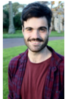
Panelist Spoken Word